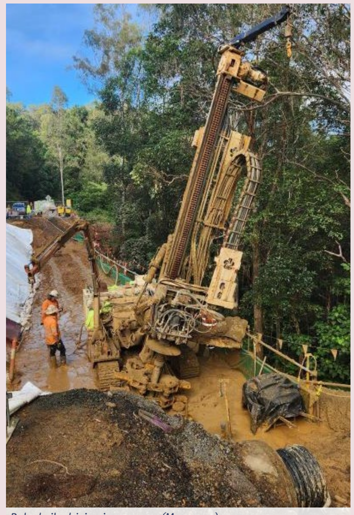
Raked pile driving in progress (May 2024)