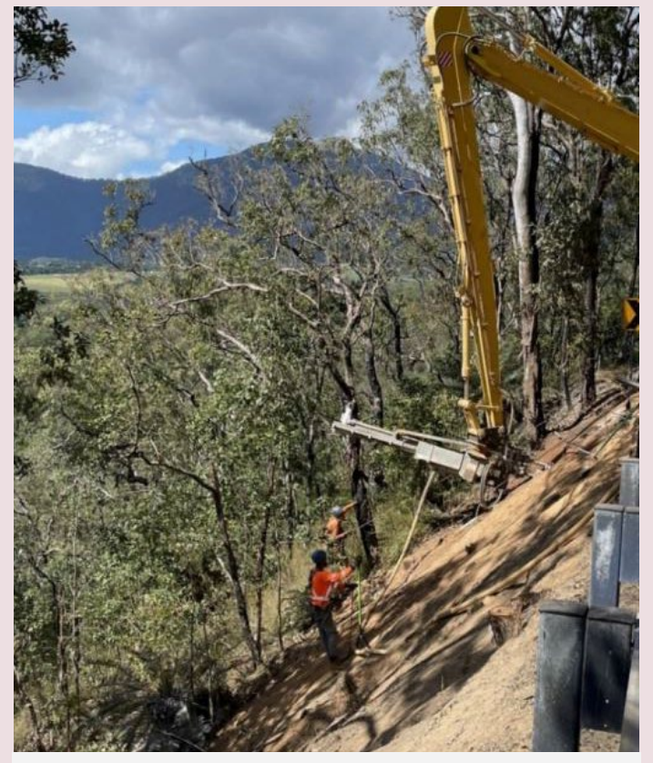
Stabilisation works in progress (July 2024)