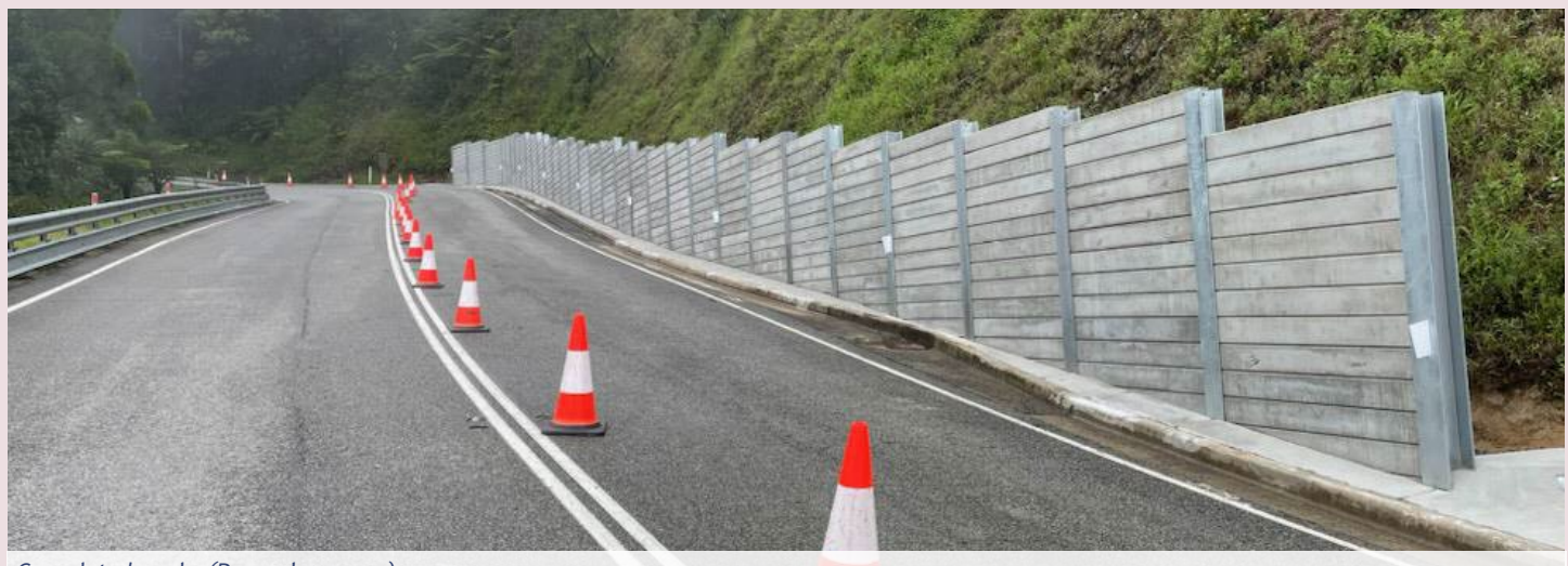
Completed works (December 2024)