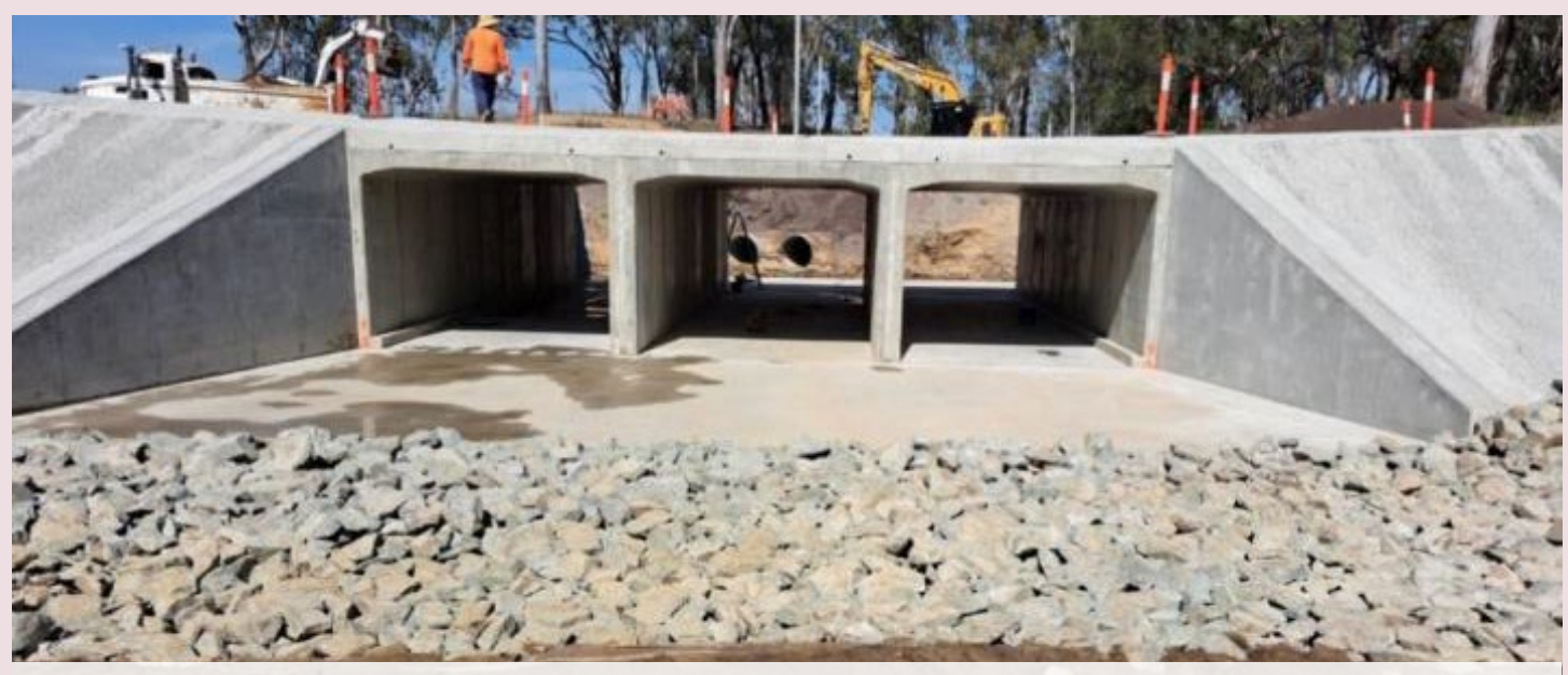
Completed works (November 2024)