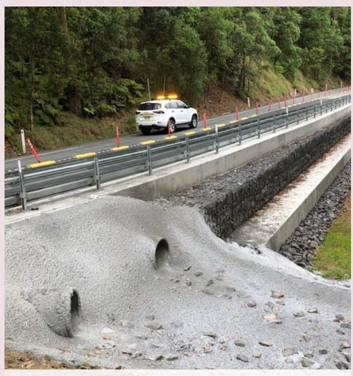
Completed reconstruction works (November 2024)