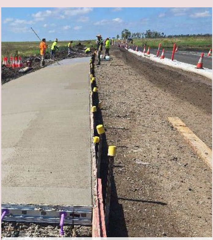
Betterment works in progress at Ashall Creek (December 2024)

The extraordinary disaster assistance is being provided through the jointly funded Commonwealth-State Disaster Recovery Funding Arrangements (DRFA).