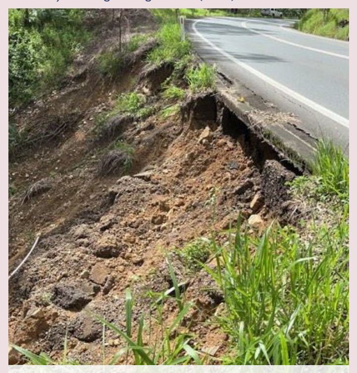
Landslip caused by SEQ Rainfall and Flooding event (March 2022)

Following extensive work to complete geotechnical investigations and detailed design, reconstruction works commenced at the main slip site in April 2024. Works included clearing loose rocks and debris, installing micro piles along the slope to support the road embankment and installing gabions (rock-filled wire baskets) to restore slope stability. Other works along Kilcoy—Beerwah Road included soil nailing, shotcreting, hydromulching and cleaning table drains.