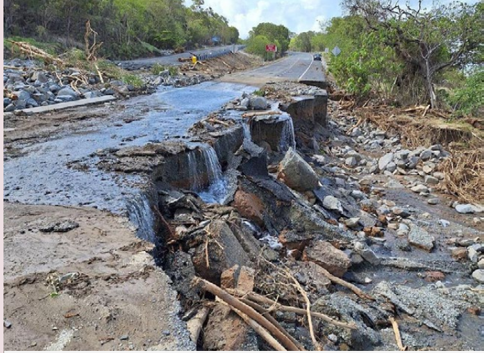
The destruction from Jasper closed roads and isolated communities

To ensure the strong recovery progress can continue, the Queensland and Australian Governments have established a new $208 million support package for further community recovery in the Far North and south-east.