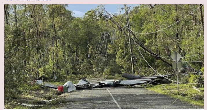
The SEQ storms caused an incredible amount of damage to the road network

The scale of impacts from both disasters combined with the remoteness of many affected areas have created a herculean challenge for support agencies, councils and communities.