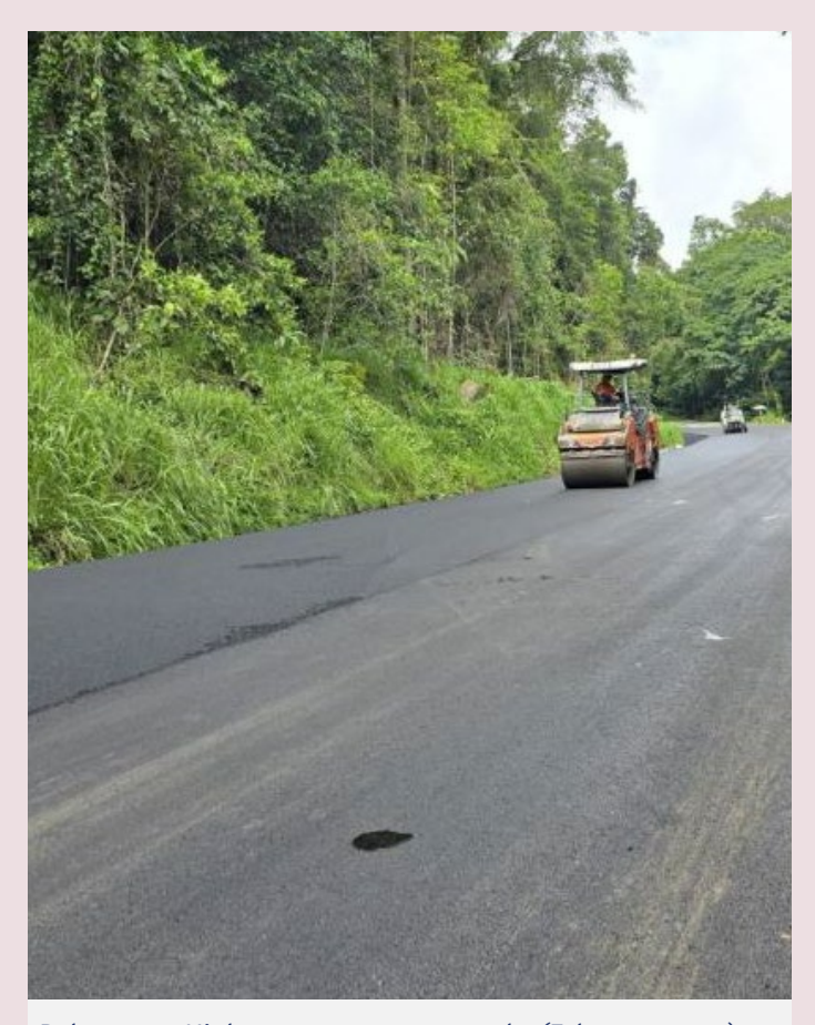
Palmerston Highway – emergency works (February 2024)

Once this next phase of works is completed, the major landslip sites that have required single-lane traffic control will be returned to two lanes.