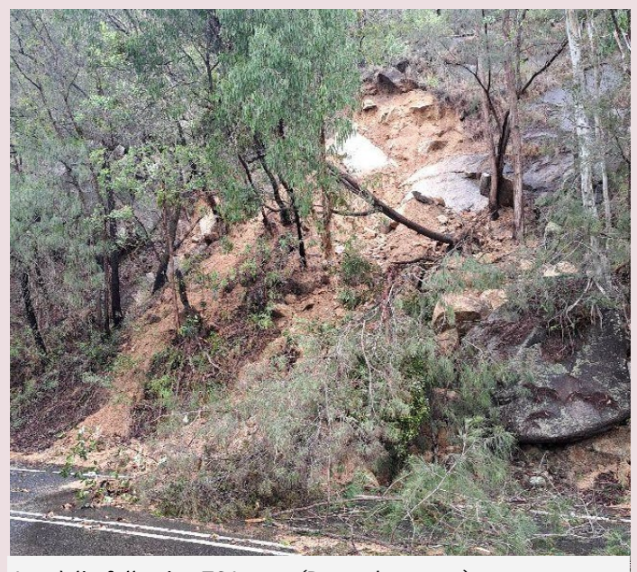
Landslip following TC Jasper (December 2023)

More reconstruction works will be undertaken at other damage sites along Gillies Range Road as detailed designs are completed and road construction contractors are mobilised.