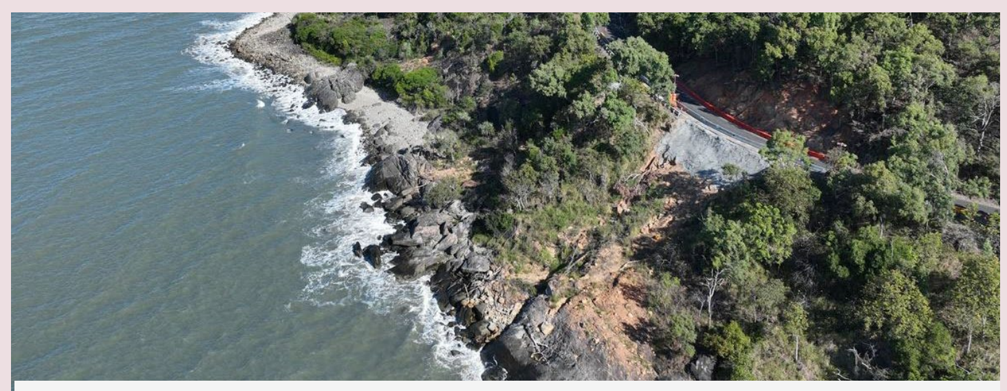
Captain Cook Highway – major landslip site (September 2024)

Transport and Main Roads (TMR) has engaged four contractors to begin the massive task of long-term reconstruction works on Far North Queensland roads damaged by Tropical Cyclone Jasper.