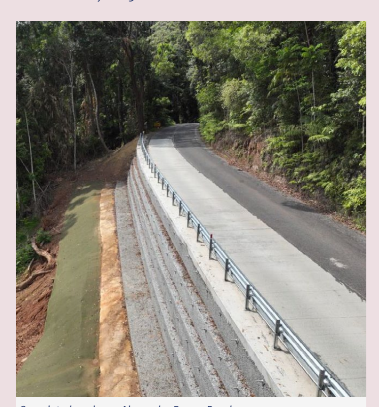
Completed works on Alexander Range Road

Restoring Cape Tribulation Road across Alexandra Range has been a massive undertaking and, with a further five sites still to be repairs, work is expected to continue until the end of May 2025.