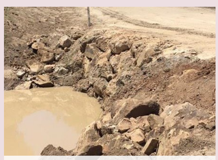
Completed emergency works at Gwambegwine Creek (Dec 2021)