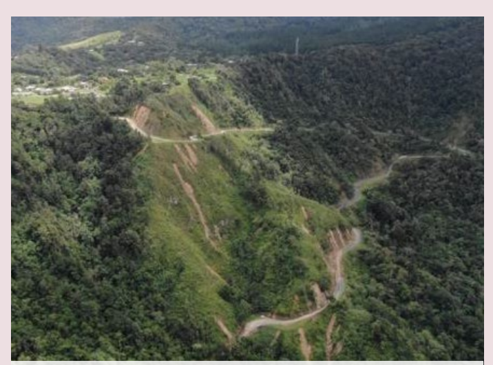
Multiple landslips caused by heavy rainfall (January 2023)

Transport and Main Roads (TMR) has completed restoration works including landslip repairs at 17 sites along Mackay—Eungella Road west of Mackay, damaged by record-breaking rainfall in 2023. Mackay—Eungella Road is the main link between Mackay, the rural townships of the Pioneer Valley and the tourist area of Eungella Range.