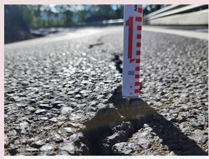
Pavement cracks (May 2024)

Reopening the Gillies Range Road to two lanes is an important step in Far North Queensland's disaster recovery process as it will be a vital link for Cairns and Tableland communities when future repairs get underway on other roads.