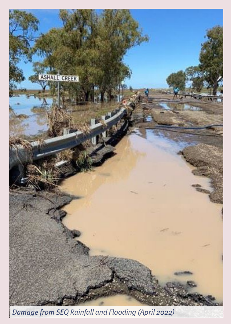
Foamed bitumen on the northern side of Ashall Creek (Dec 2024)