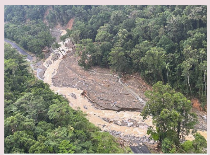
Tropical Cyclone Jasper broke more than a century of flood records

For Jasper and the SEQ storms this included more than $61 million in Personal Hardship Assistance that helped around 275,000 people. Queenslanders can rest assured that wherever and whenever disaster strikes, QRA will be there to drive recovery and help those in need.