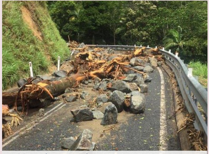
Landslip site (January 2023)

Further clearing and stabilisation works were undertaken to enable 24-hour access to be restored from 25 February 2023. This included debris removal and stabilising embankments above the roadway by securing and removing loose boulders, vegetation and other material to reduce the risk of further slips. Crews also repaired damaged bitumen, drainage, scours, headwalls and kerbs.