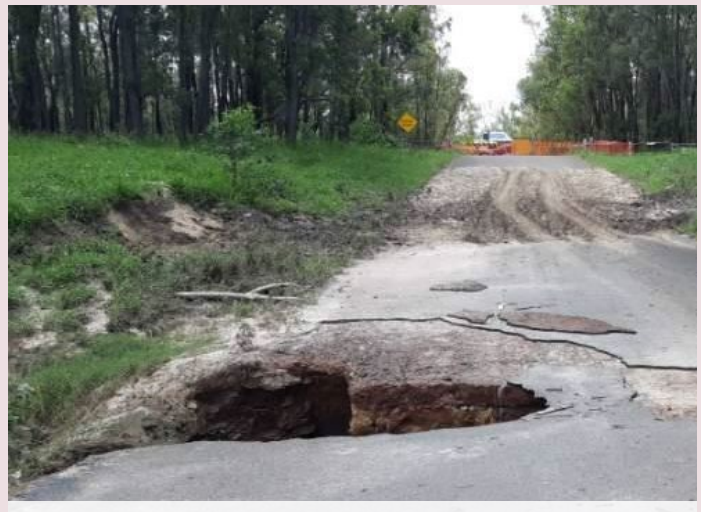
Culvert damage at Gwambegwine Creek (Dec 2021)

Roadsides were also cleared of silt, debris and vegetation around culverts to ensure unobstructed water flow under the road.