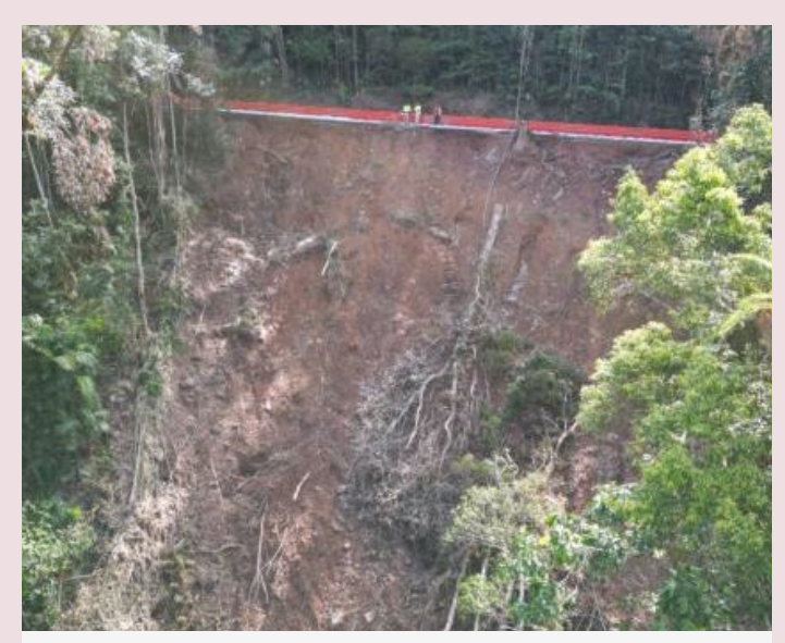
Massive landslips on Alexander Range Road made it unsafe for traffic

Emergency works at 13 sites allowed the road to reopen in early-2024, albeit with restrictions on the type of vehicles allowed on the road and overnight travel curtailed for safety reasons.