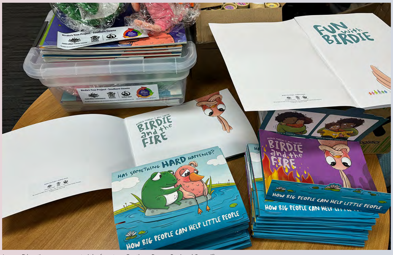
Image: Education program materials.