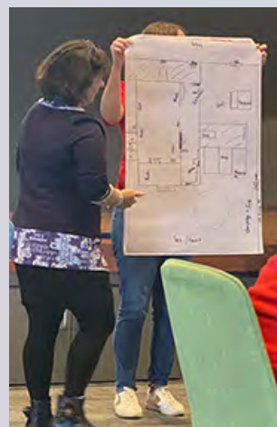
Goomburra community initiative