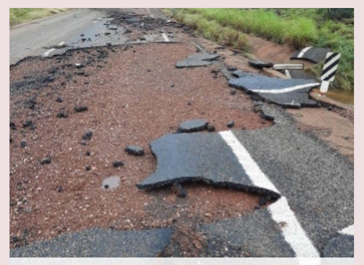
Landsborough Highway (Kynuna–Cloncurry) – seal delamination at floodway