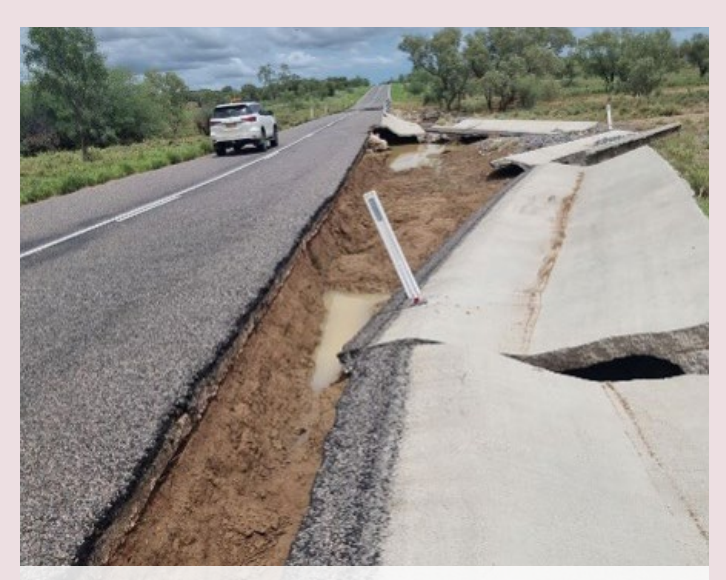
Landsborough Highway (Kynuna–Cloncurry) – concrete batter damage at Wild Duck Creek