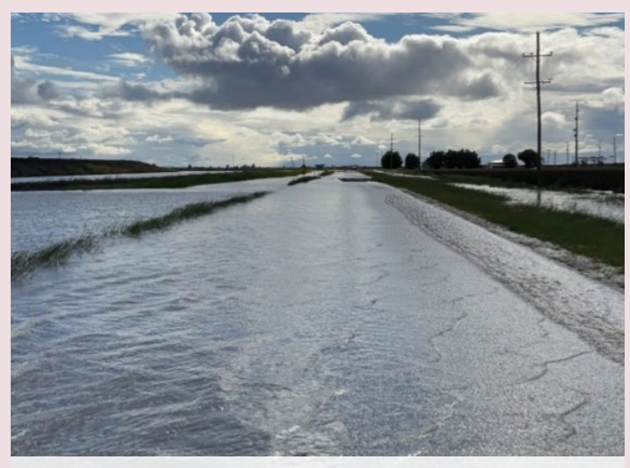
Toowoomba–Cecil Plains Road – flooding from South East Queensland Rainfall and Flooding event (late March 2022)