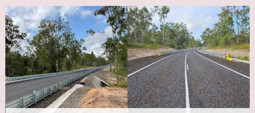
Booyal–Dallarnil Road – completed works at Stoney Creek prior to line marking (April 2024)