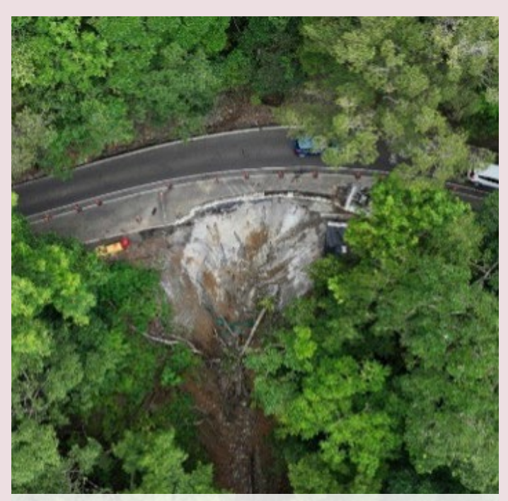
Kuranda Range Road – landslip site (March 2024).