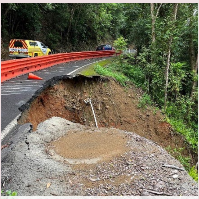
Kuranda Range Road – landslip site (February 2024).

The recovery works are jointly funded by the Australian and Queensland Governments through the Disaster Recovery Funding Arrangements (DRFA).