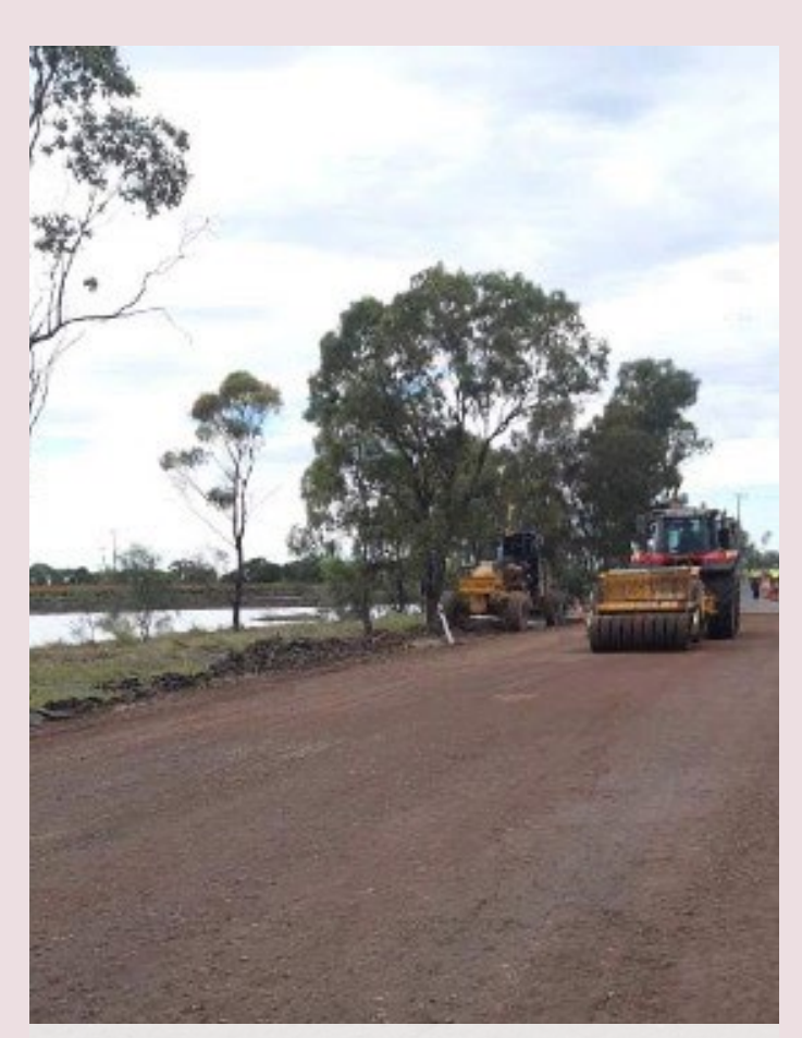
Toowoomba–Cecil Plains Road – emergency works near Condamine River (early March 2022)