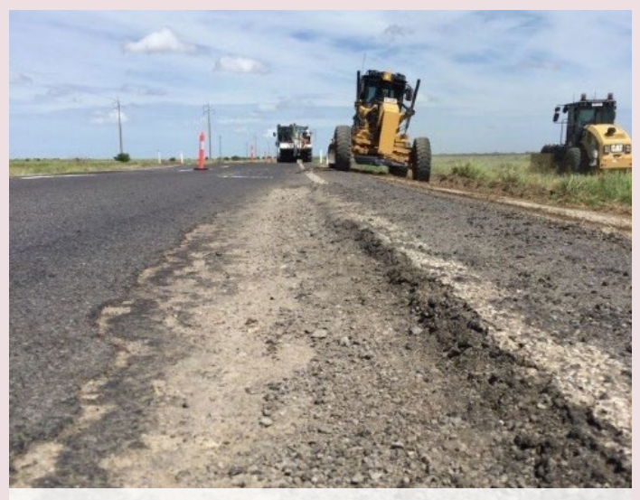
Flinders Highway – emergency works to repair pavement damage