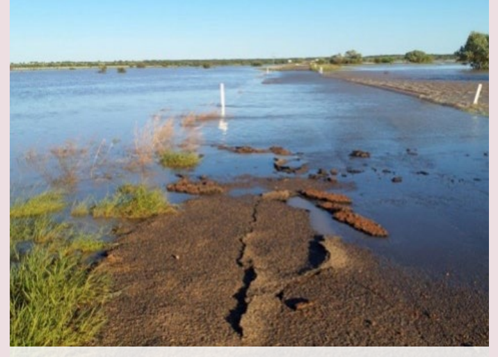
Wills Developmental Road – pavement damage due to long-term inundation