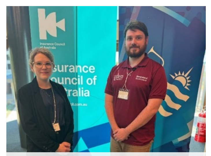
QRA representatives at the 22nd annual Wind Engineering Society workshop in Adelaide.

The team also attended the Australasia Wind and Engineering Society (AWES) conference in Townsville in June where ideas on resilience modelling were explored, including novel ideas of how building functionality contributes to community functionality and if measuring impacts on community resilience could be achieved during damage assessments.