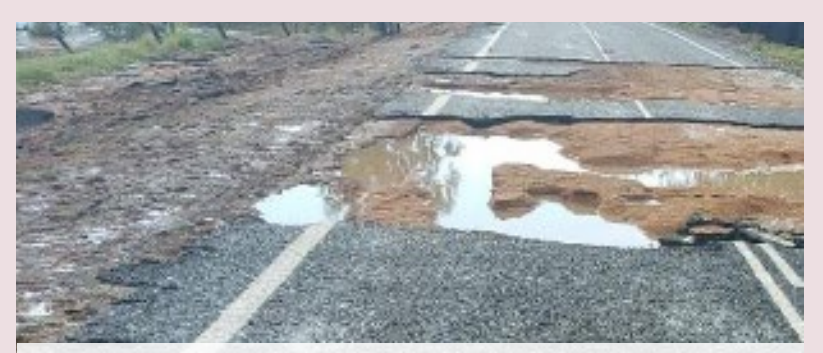
Booyal–Dallarnil Road – pavement damage caused by South East Queensland Rainfall and Flooding (February 2022)