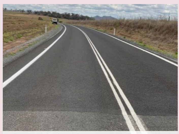
Toowoomba–Cecil Plains Road – completed reconstruction works (November 2023)