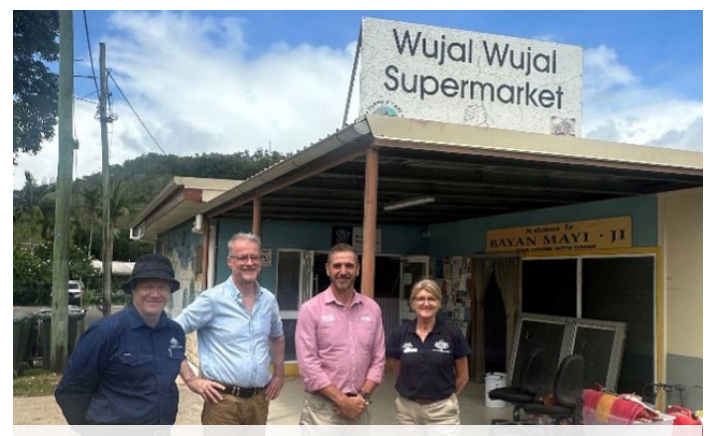
Senator Sheldon, QRA and NEMA visiting local Councils gathering information on their recovery priorities and needs.

The plan was an evolution on previous State recovery plans by capturing all 13 events of the 2023-24 severe weather season in one document, equipping State departments and agencies to work in a more efficient manner on multiple recovery projects at once. With many impacted communities being remote, this enables Councils and State government to prioritise the use of scarce labour and equipment onto the local council's greatest need, regardless of which disaster in the 2023-24 season it resulted from. Overall, this speeds up recovery of the community and strengthens integration within the Queensland disaster management system at the same time.