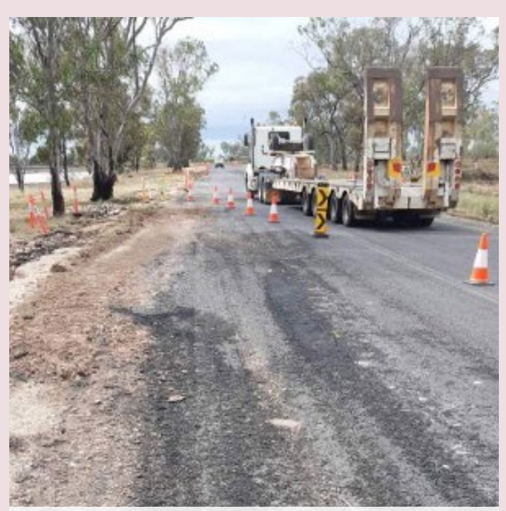
Toowoomba–Cecil Plains Road – pavement damage near Condamine River from Central, Southern and Western Queensland Rainfall and Flooding (December 2021)

The recovery works are jointly funded by the Australian and Queensland governments through the Disaster Recovery Funding Arrangements (DRFA).