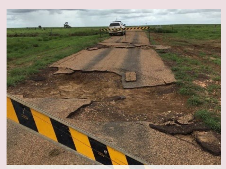
Kennedy Developmental Road (Winton–Boulia) – pavement damage