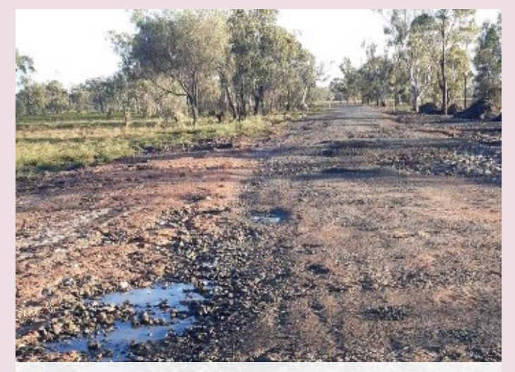
Toowoomba–Cecil Plains Road – pavement delamination from Southern Queensland Flooding event (May 2022)