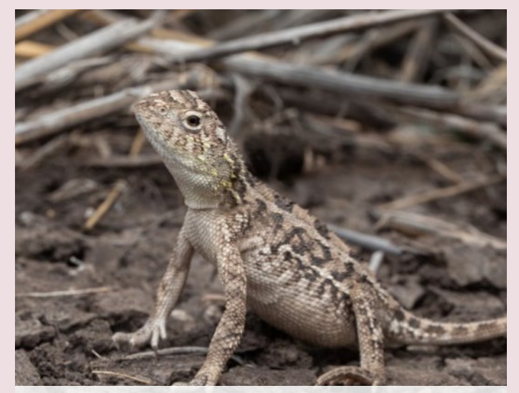
Condamine earless dragon