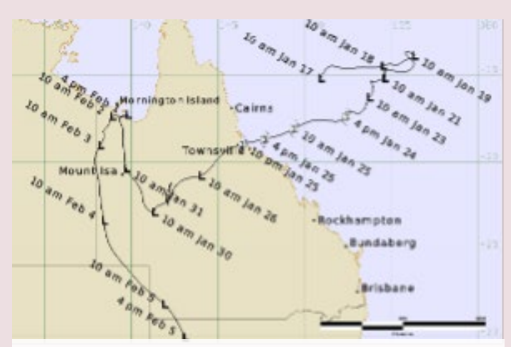
Severe Tropical Cyclone Kirrily track map

The recovery works are jointly funded by the Australian and Queensland Governments through the Disaster Recovery Funding Arrangements (DRFA).