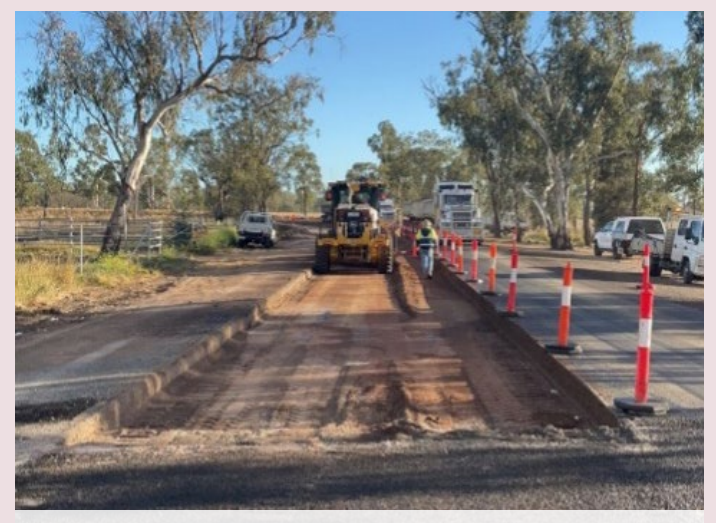
Toowoomba–Cecil Plains Road – reconstruction works (October 2023)