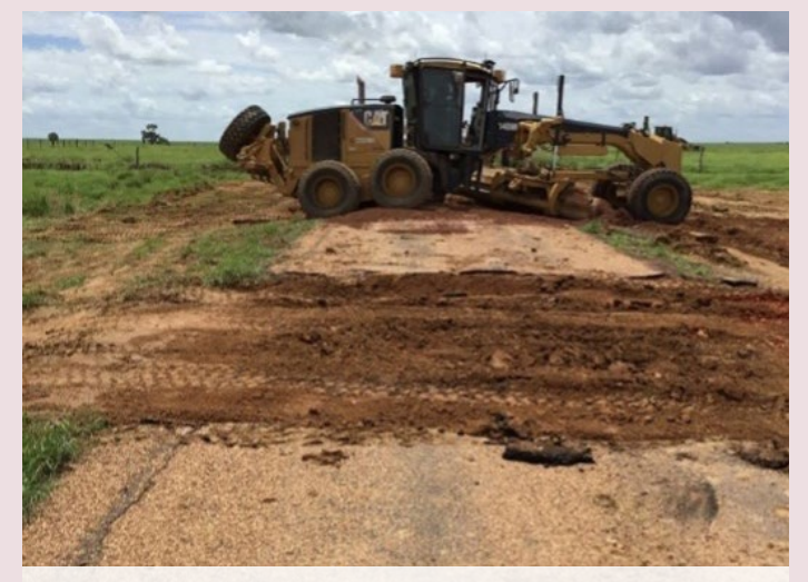
Kennedy Developmental Road (Winton–Boulia) – emergency works