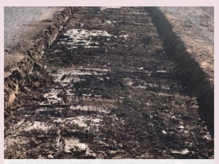
Toowoomba–Cecil Plains Road – black soil subgrade at Evanslea Floodway