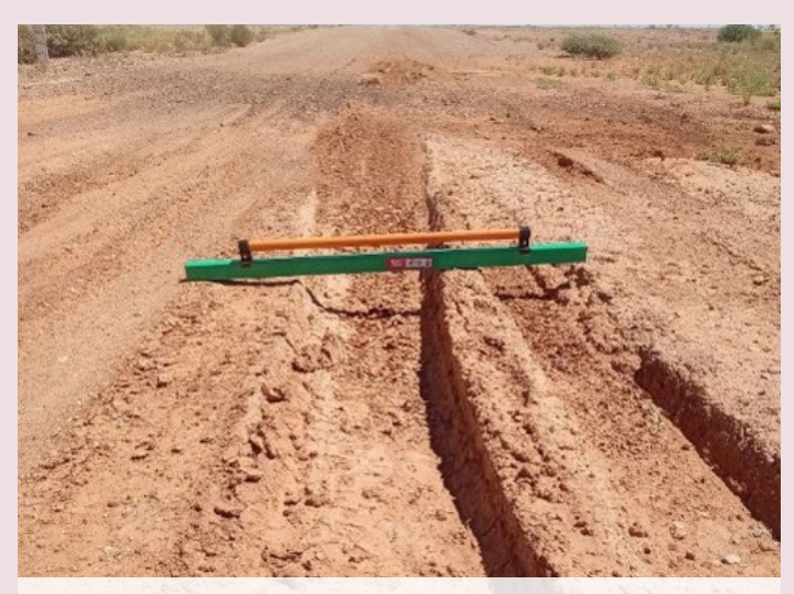
Diamantina Developmental Road (Windorah–Bedourie) – severe rutting