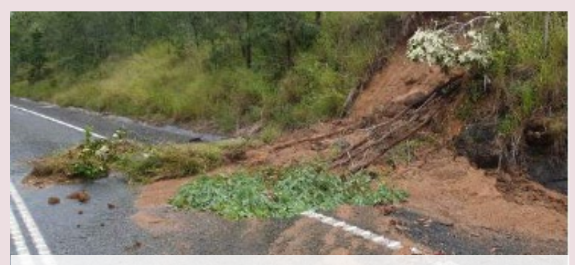
Booyal–Dallarnil Road – batter slip caused by Ex-Tropical Cyclone Seth (January 2022)

The recovery works are jointly funded by the Australian and Queensland Governments through the DRFA.