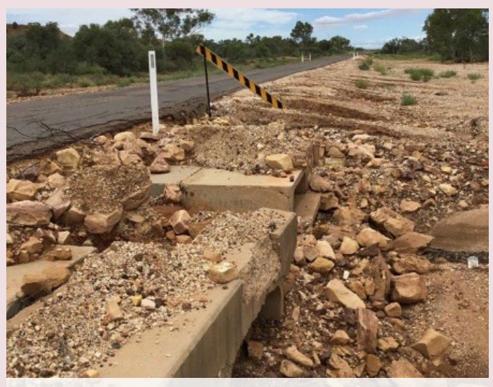
Kennedy Developmental Road (Winton-Boulia) – culvert damage