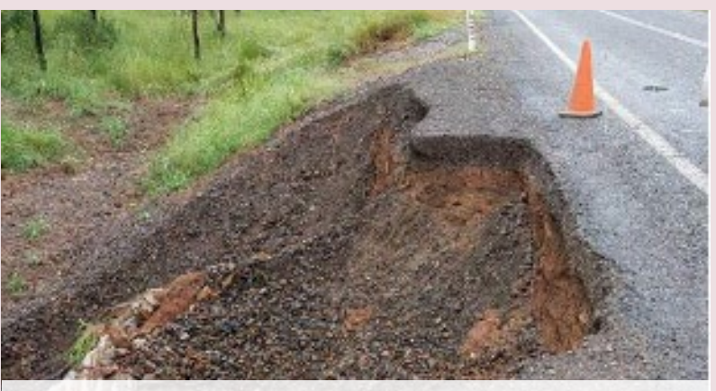
Booyal–Dallarnil Road – culvert damage caused by South East Queensland Rainfall and Flooding (February 2022)