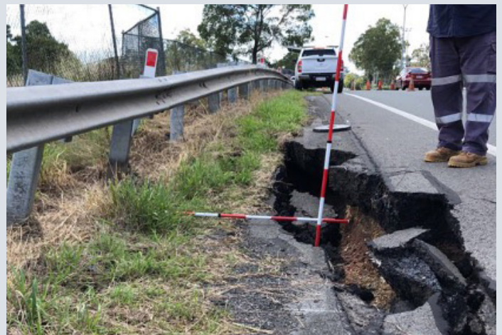
Brisbane Road – part of the 800mm crack next to the road (March 2022)