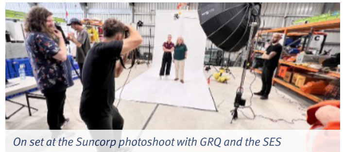
On set at the Suncorp photoshoot with GRQ and the SES

Suncorp has been GRQ's major sponsor since 2019, making it possible for GRQ's disaster preparedness campaigns to reach more households across the state. Meantime, the SES continues to be an important stakeholder, playing a critical role community education.