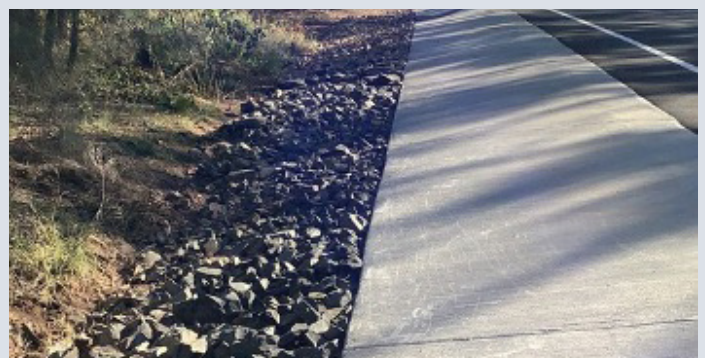
Moonie Highway (Dalby–St George) – completed works (April 2023)