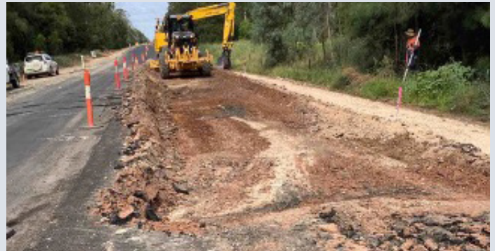
Moonie Highway (Dalby–St George) – floodway reconstruction works (January 2023)

The betterment works were delivered as part of a program of improvements to essential public assets damaged during last year’s flooding, through the Australian and Queensland Governments’ $170 million Betterment Fund for 2021–22. This extraordinary assistance is provided through the DRFA.