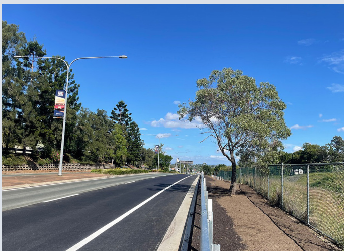
Brisbane Road – completed works (April 2023)