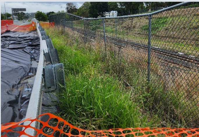
Brisbane Road – rail corridor running alongside the road at the damage site (March 2022)

Assistance will be provided through the jointly funded Commonwealth-State Disaster Recovery Funding Arrangements (DRFA).