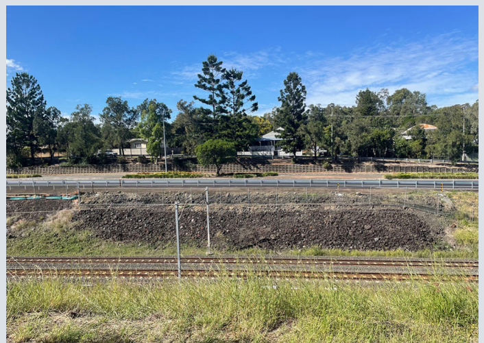
Brisbane Road – completed works (April 2023)