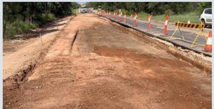
Moonie Highway (Dalby–St George) – floodway reconstruction works (January 2023)