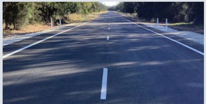
Moonie Highway (Dalby–St George) – completed works (April 2023)