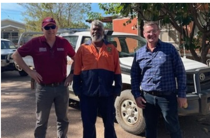
QRA Recovery officer, Burke Shire staff, and DEPW staff travelling through Burke Shire Council to assess accommodation needs

As part of ongoing recovery efforts, a QRA RRO and officer from Queensland’s Department of Energy and Public Works met with Burke Shire Council’s Local Recovery Coordinator to visit several flood-affected properties to ascertain the need for temporary accommodation in the region. QRA Regional Liaison Officers and RROs continue to work alongside councils, state agencies and Non-Government Organisations to support the recovery effort across the region.