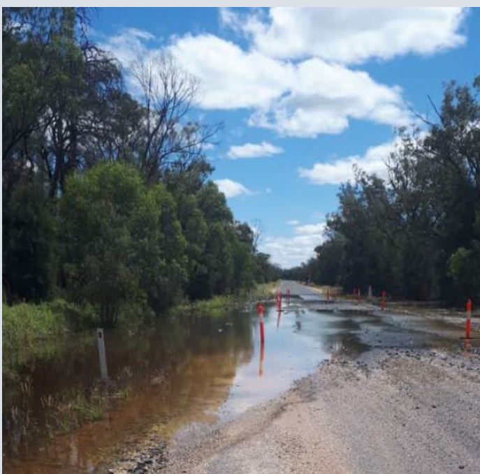
Moonie Highway (Dalby–St George) – water over road (March 2022)