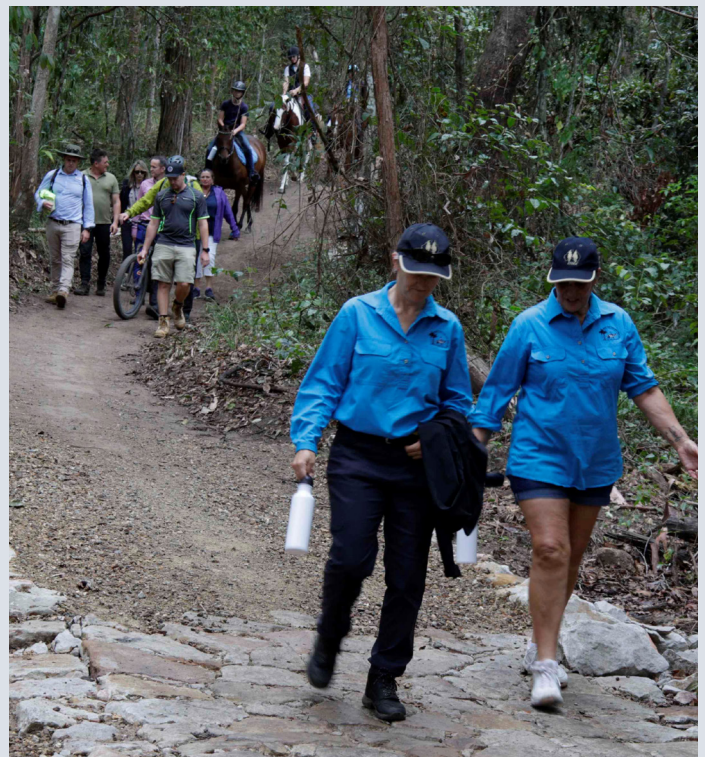
Walking and riding the Cooroora Trail