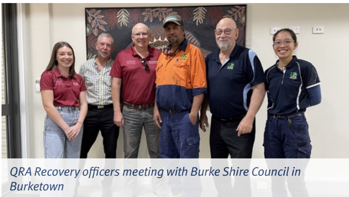
QRA Recovery officers meeting with Burke Shire Council in Burketown

In May, RROs worked with Burke Shire Council and Doomadgee Aboriginal Shire Council on the ongoing development of Event Specific Local Recovery plans (ESLRP). Burke Shire Council has since presented this plan to Council and it has been formally endorsed.