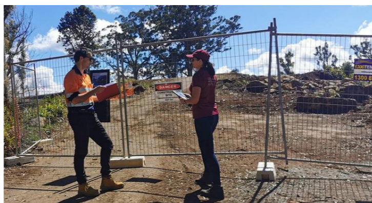
Image: QRA Recovery and Liaison officers undertaking a damage assessment where Binna Burra Lodge once stood.

The DARMSys process has indicated a number of properties still in various stages of reconstruction, and some are still working to remove debris from properties. The team was also able to make referrals to support services for some residents who had not accessed them before.