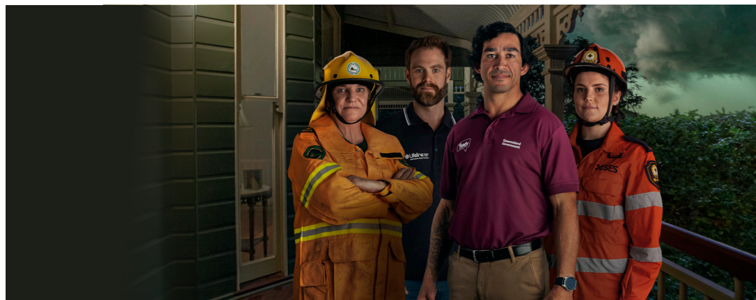
Image: advertising campaign featuring GRQ’s ambassador Johnathan Thurston