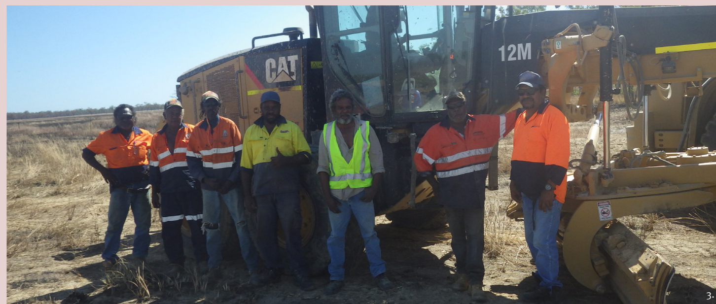
Images: (1.) Works in action (2.) Resealing complete (3.) Kowanyama Road Crew with newly purchased plant equipment.