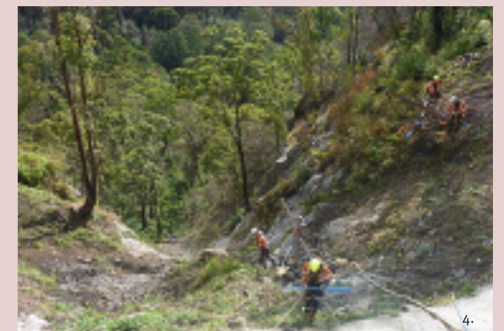
Images: (1.) Binna Burra Road – rock descaling with long reach excavator (2.) Binna Burra Road – drape mesh and rock gabions (3.) Binna Burra Road – rock gabions and drape mesh (4.) Binna Burra Road – workers abseiling down steep slopes to install soil nails.