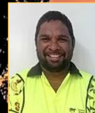
Mayor Ralph Kendall